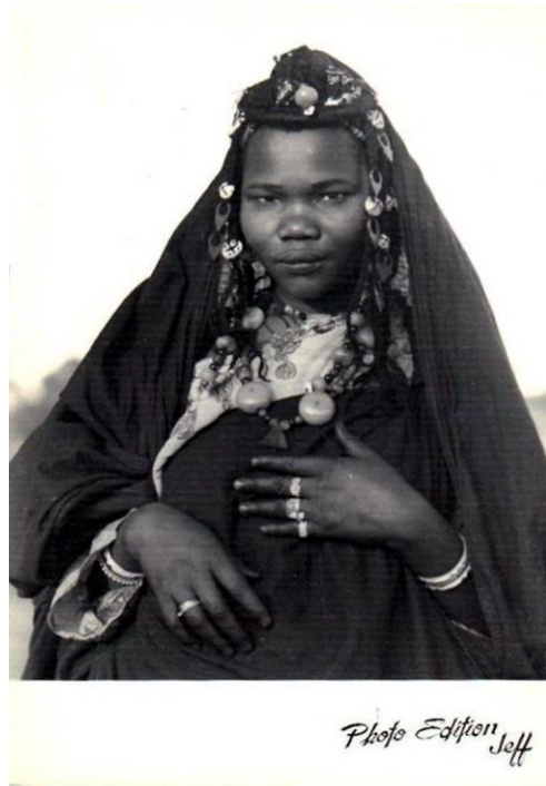
Black woman of the valley town of Zagora, Morocco, year unknown

A staggering example of the survival of this demeaning collective imagery in the Maghreb is the myth of the black woman that “purifies the blood”. This urban legend entrenches the idea that intercourse with a woman of color holds healing properties. Several black women, including activists in Tunisia 14 , and university students in Morocco 15 , have testified to the prevalence of attacks and indecent proposals based on this myth.