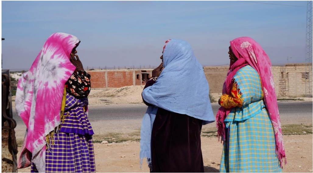
Women of the slave-descendant Abid Ghbonton tribe, Gabes, Tunisia (Becoming the Abid, Scaglioni, 2020)