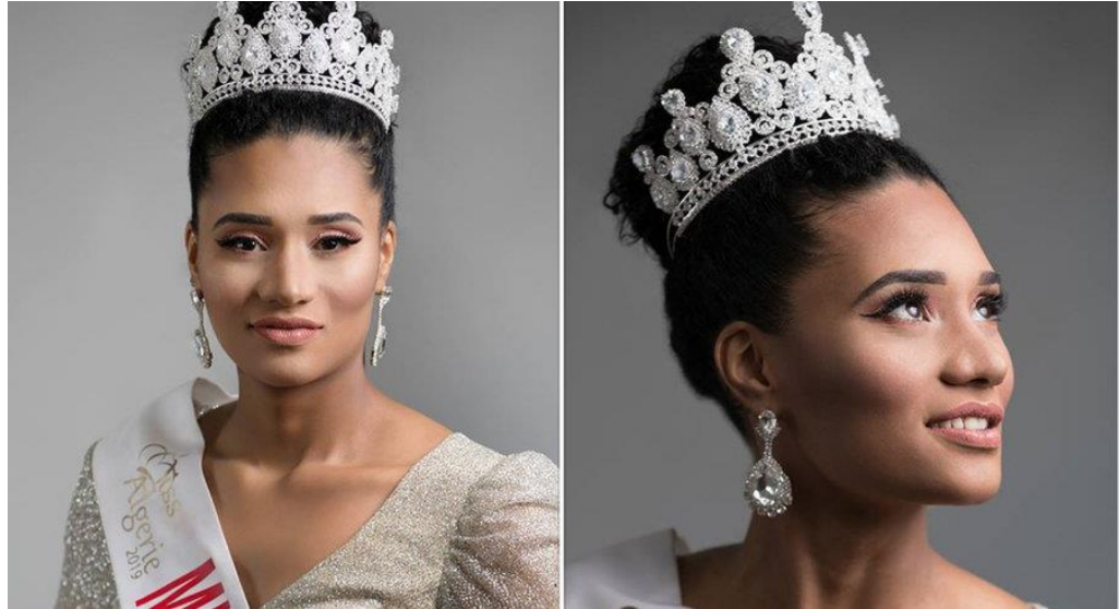
Miss Algeria 2019, whose election provoked a wave of racist comments

the family. It does not recognize racial discrimination in its foundation as it considers piety to be the essence of differentiation between human beings. 13